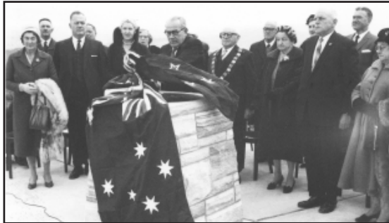
Premier Cahill and guests at the opening ceremony.

The rather elaborate Cahills Lookout was built by Blue Mountains City Council in 1959. There are three platforms, the side ones giving different views. It was opened on June 6th 1959 by (and named after) John Joseph Cahill (1891–1959), Premier of NSW from 3rd April 1952 to 28th October 1959. The Cahill Expressway in Sydney also bears his name. I'd rather be remembered by a mountain lookout than a freeway!