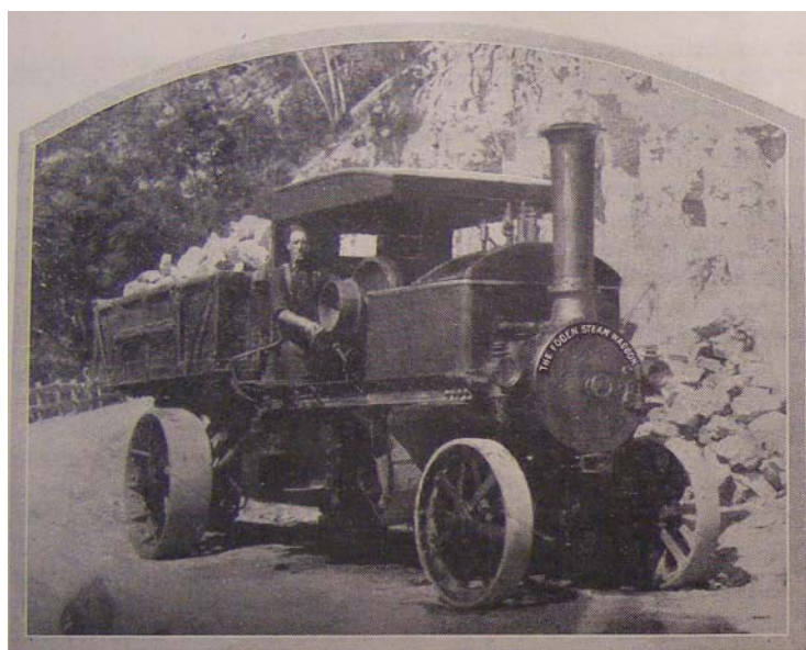
FIGURE 8.2: Could this be the Blue Mountains Shire Council Foden steam wagon? The fence in the background is the same type of fence that was on Berghofers Pass where the Council had their first chert quarry lease. The rock in the truck is "blocky", similar to chert.