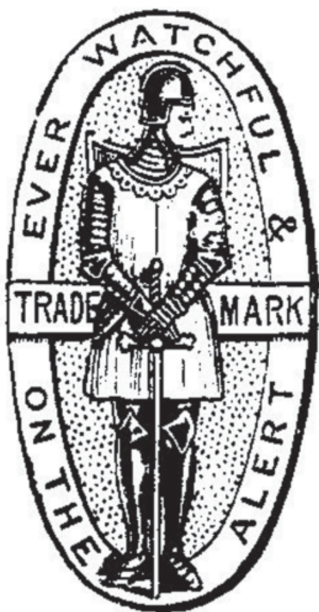
FIGURE 8.1: Sentinel logo from Instructions to Drivers For Running and Tending The "Sentinel" Steam Motor Waggon , The "Sentinel" Waggon Works, Ltd, Shrewsbury, c1920, title page. Mount Victoria and District Historical Society.